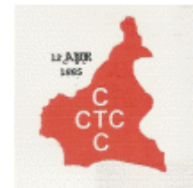
Cameroon Travel Center