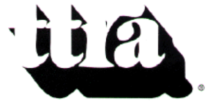
Travel and Tourism Research Association