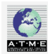
Association of Travel Marketing Executives