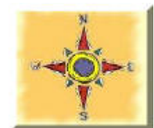
Community Tourism Planning & Design