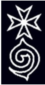
The OTS Foundation