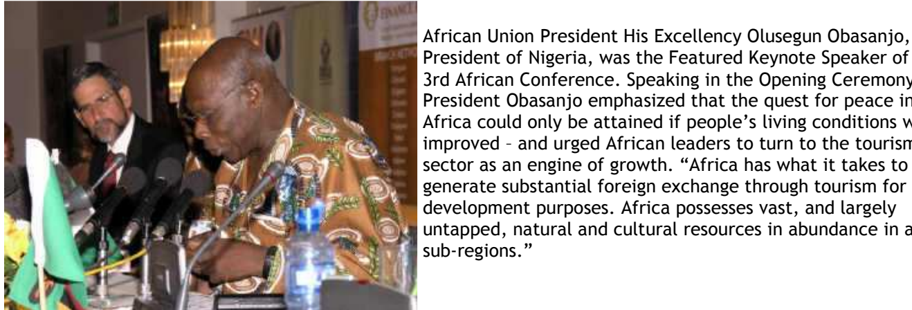
President of Nigeria, was the Featured Keynote Speaker of IIPT's 3rd African Conference. Speaking in the Opening Ceremony, President Obasanjo emphasized that the guest for peace in Africa could only be attained if people's living conditions were improved - and urged African leaders to turn to the tourism sector as an engine of growth. "Africa has what it takes to generate substantial foreign exchange through tourism for development purposes. Africa possesses vast, and largely untapped, natural and cultural resources in abundance in all it sub-regions."