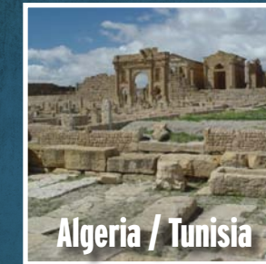
Algeria / Tunisia